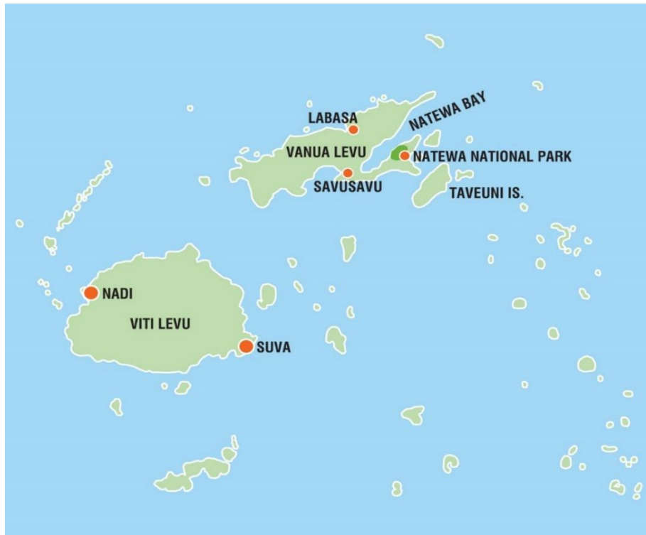
Figure 1. Map of Fiji showing main locations students stay or transit through

This expedition is split between two main field sites on the Fijian Island of Vanua Levu in the South Pacific. The first week is spent at a forest camp within the lowland tropical forests of the Island. The second week is spent at the Natewa Bay Marine Research Centre within Natewa National Park.