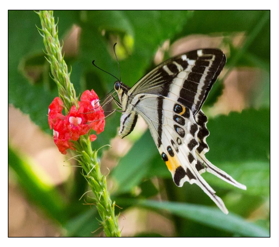
Plate 4 – Natewa Swallowtail (Papillo natewa) on the Natewa Peninsula.