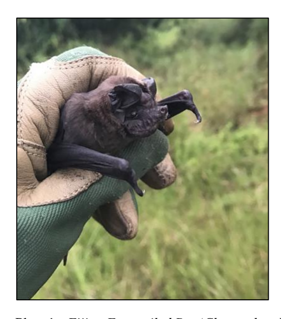
Plate 1 - Fijian Free-tailed Bat (Chaerephon bregullae), photographed on forest edge in the Natewa peninsula in July 2017.

study area lie between 175,000 and 400,000 individuals (Kerr 2018), and this population representing a severe risk to Natewa's native birds, herpetofauna, and in likelihood other taxa. Controlling this mongoose population thus, in likelihood, represents the single most pressing conservation priority for the Natewa peninsula. A detailed study plan has been submitted which aims to achieve this objective, using a combination of intensive trapping for extant Mongooses in Natewa, and the construction of a 400m fence across the base of the Peninsula to prevent further colonization by this highly invasive species (Kerr 2018) (Figure 1c).