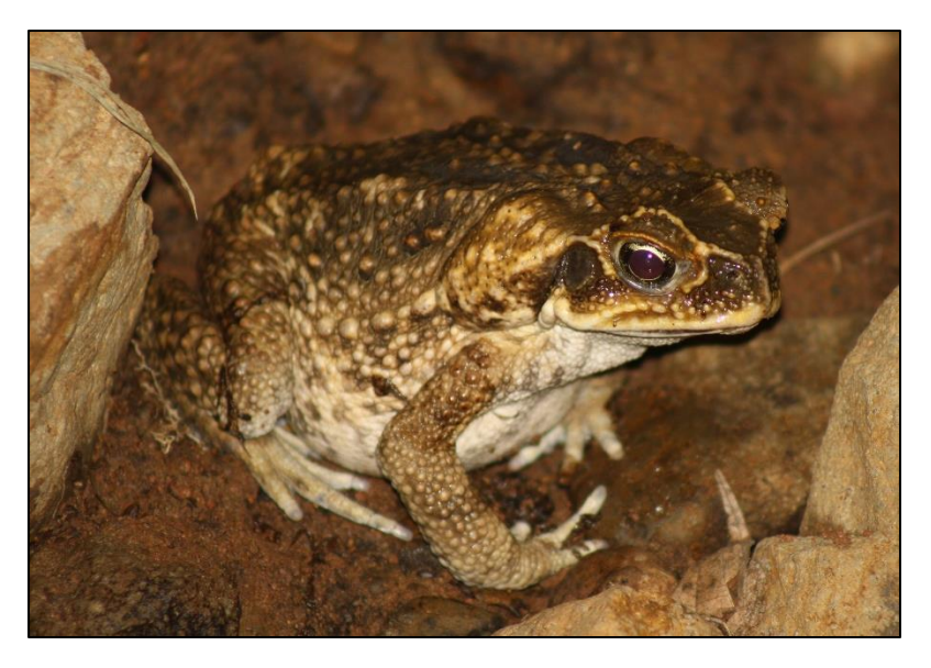
Plate 3 – Cane Toad (Rhinella marina) on the Natewa Peninsula.

A final observation of note regarding the herpetofauna of the Natewa Peninsula relates to the absence, rather than presence of a species; the endangered Fiji Banded Iguana ( Brachylophus fasciatus ). This iconic Fijian species does occur in parts of Vanua Levu, but does not appear to occur in the study area, despite the presence of large tracts of suitable forest habitat. It may be that the species has never colonized the peninsula due to its biogeographical isolation, but it may also be the case that it has been extirpated due to pressure from invasive species, such as the Small Indian Mongoose.