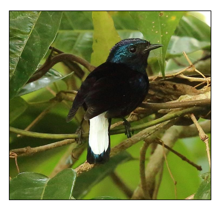
Plate 2 - Natewa Silktail (Lamprolia klinesmithi) in the forests of the Natewa Peninsula – the only locality where it occurs.