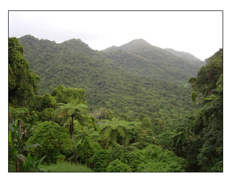
Plate \ 5-The\ forests\ of\ the\ Natewa\ Peninsula;\ a\ major\ source\ of\ carbon\ stocks.