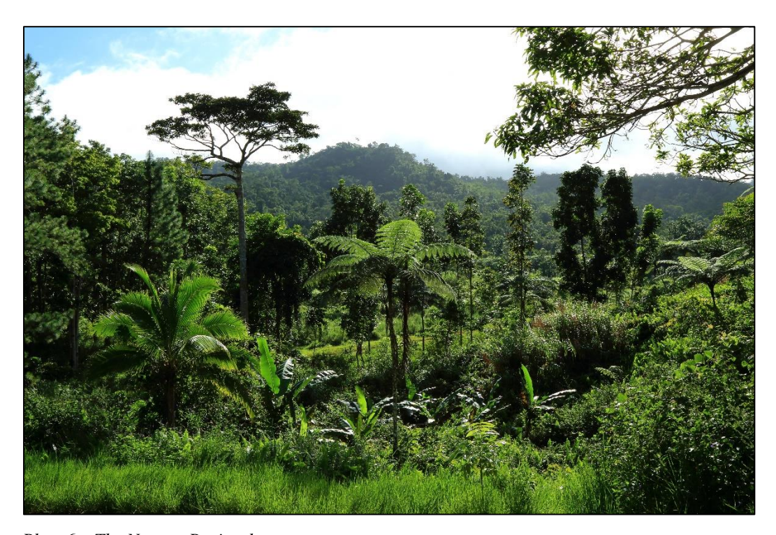
Plate 6 – The Natewa Peninsula

assessments of carbon stocks than has been possible to date. However, while further work remains to be completed to refine our knowledge of the study area, the data presented in this report clearly shows the Natewa Peninsula possesses extremely high conservation value, and represents a high priority area for conservation projects aiming to protect the biodiversity of this Pacific island nation.