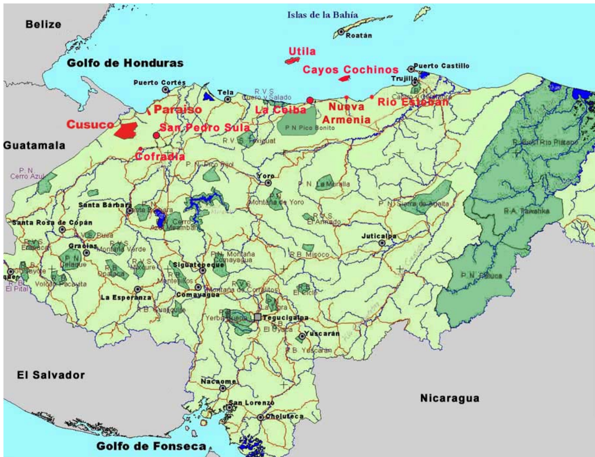
Figure 2 Location of the marine sites

Details of the travel between the various sites is provided in the transport section of this document.